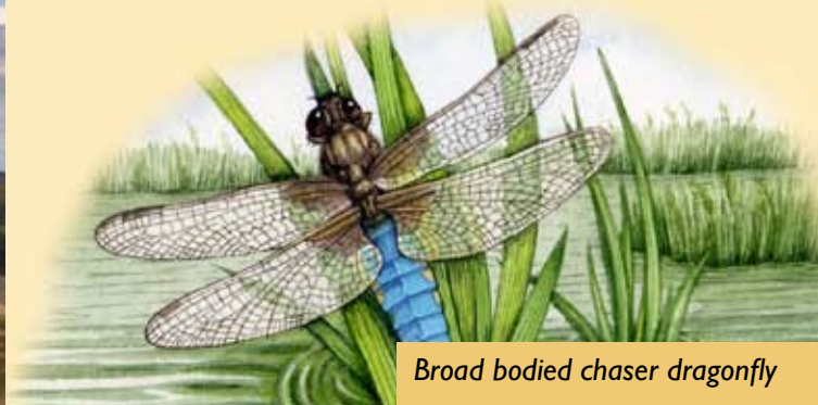
Broad bodied chaser dragonfly

The spoil heaps from the abandoned lead mines have been slowly reclaimed by nature and the mine reservoirs are home to a variety of aquatic plants and animals.