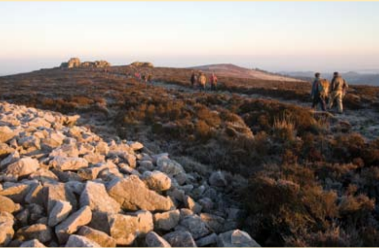
The Stiperstones skyline

The Stiperstones area is a stunning landscape. It has dramatic and wild scenery, sheltered valleys with villages and hamlets linked by narrow country lanes. The area is steeped in history and folklore - there are ancient cairns, hill forts and historic lead mines as well as spine-chilling tales of The Devil, Wild Edric and local witches. It is also a haven for wildlife and includes The Stiperstones National Nature Reserve. Look out for magnificent birds of prey, delicate wildflowers and some of the oldest holly trees in Europe.