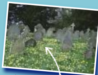
Acton Scott church yard is a haven for wildlife

2 Cross the stile and bear left across the field to cross a stile in the far corner. Go on up the field then right and through the wicket gate into the church yard.