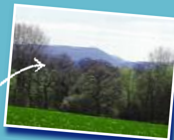
to the south is the distinctive Wenlock Edge

Descend across the corner of the field to cross a stile next to a gate. With the fence on your left, carry on to cross a stile into a wood. Go right, up the edge of the wood, to cross a stile into a field. Bear left across the field and cross the stile into the car park.