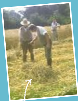
harvest is still hard work on the farm

Your walk starts from Acton Scott Historic Working Farm Museum where you can experience daily life on an upland farm at the turn of the century.