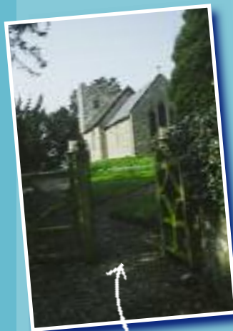
take time to walk around Acton Scott church

outpost of the western most province of the Roman Empire. Zooming forward in time to the Norman Conquest of Britain, you will find the Manor owned by the Acton family. The Actons are one of the few ancient English families who can trace their ownership of the land to before 1066!