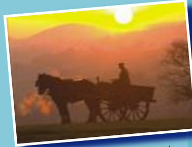
ask for the Wagoner's Wander, the other walk in this series

Continue down through the wood in the same direction, crossing two fields to join a farm track. Go up the track to meet a lane.